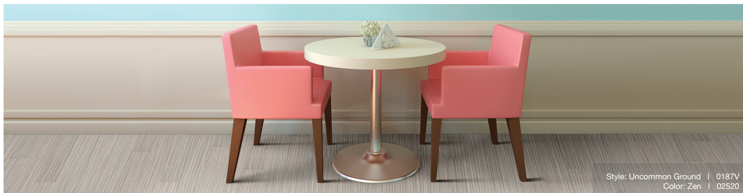
Style: Uncommon Ground | 0187V Color: Zen | 02520